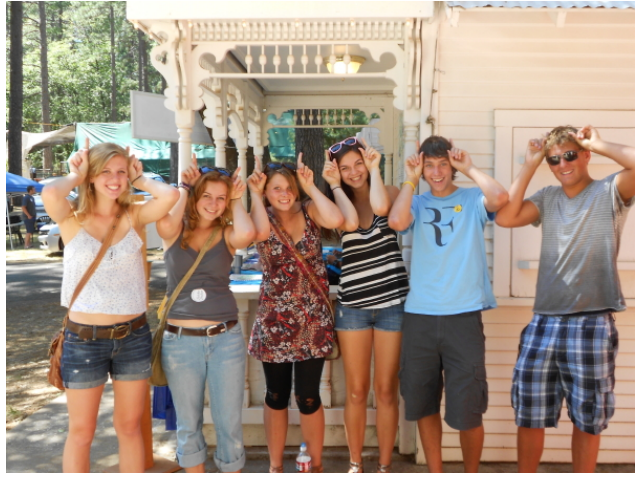
Pretend you're a bee!